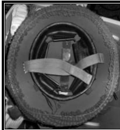
Mk IV to Mk III conversion with liner in place