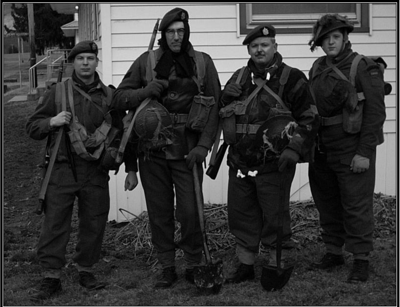
Q.O.R.C. Recreated at Nordwind event