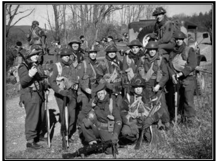
"B" Company with our trusty transport...