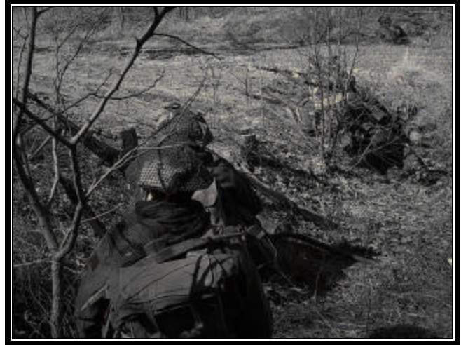
In the trenches...